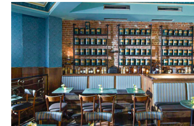
THE DEVIL'S ACRE