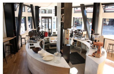
REVEILLE COFFEE CO