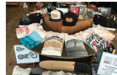
IRON & RESIN