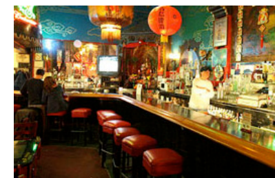
LI PO COCKTAIL