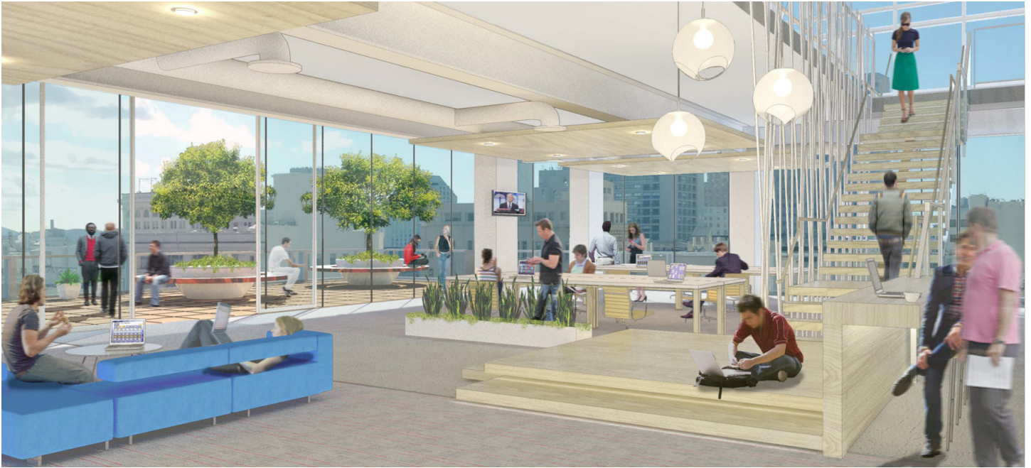
13TH FLOOR INDOOR WORKPLACE/OUTDOOR TERRACE